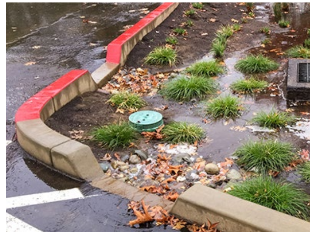
Retrofits for TMDL compliance