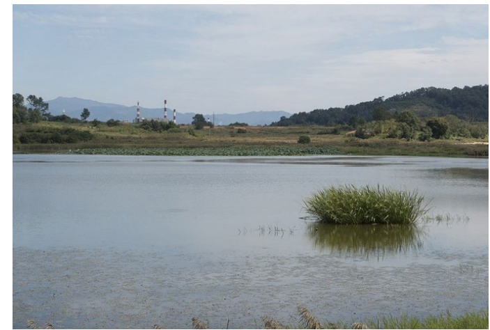
Stormwater as a Resource