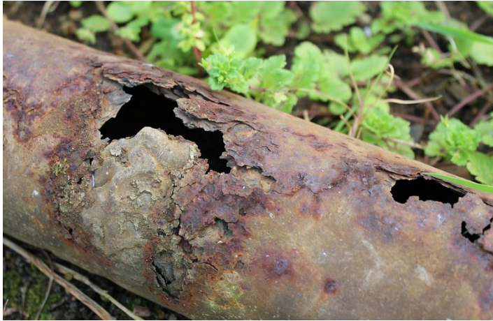
Aging drainage infrastructure