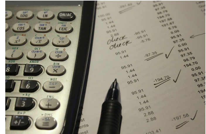
MS4 Permit compliance