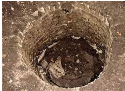
Groundwater decline & depletion

The EPA is considering changing the rules regulating lead and copper content in drinking water