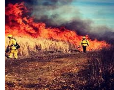
Climate change: floods, drought, fire,...