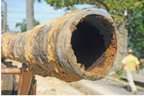
Aging drainage infrastructure