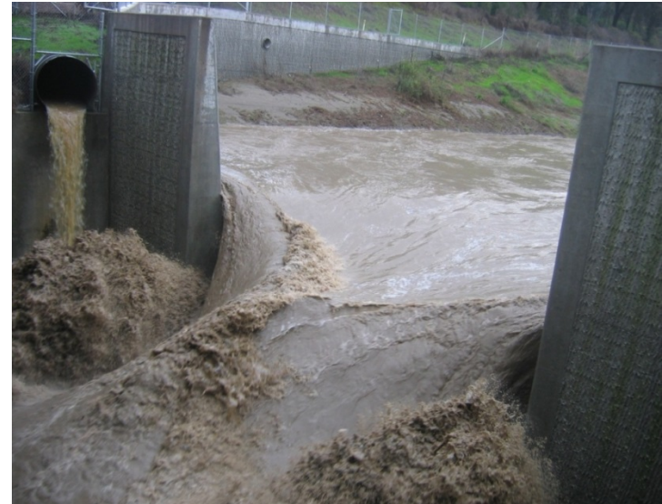
Regional Flood Protection