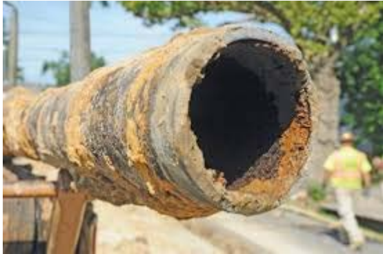
Aging drainage infrastructure