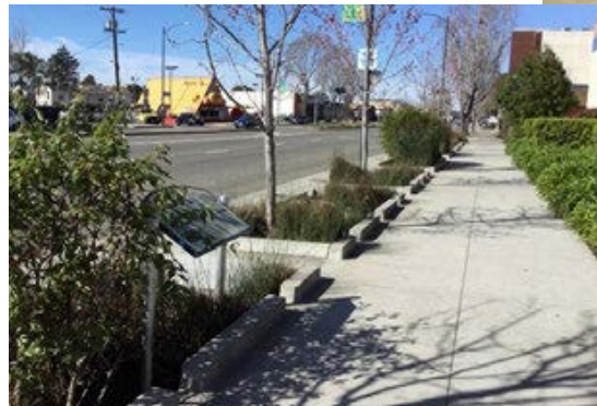
Retrofits for TMDL compliance